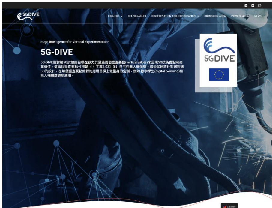
FIGURE 2: 5G-DIVE MAIN WEBSITE (CHINESE).

Statistics until September 2020 have been gathered for the website. They are reported in Figure 3. It can be observed that, since the beginning of the project (i.e., “last 365 days” statistics), the website had almost ten thousand visitors, bringing the total to 21 594 visits.