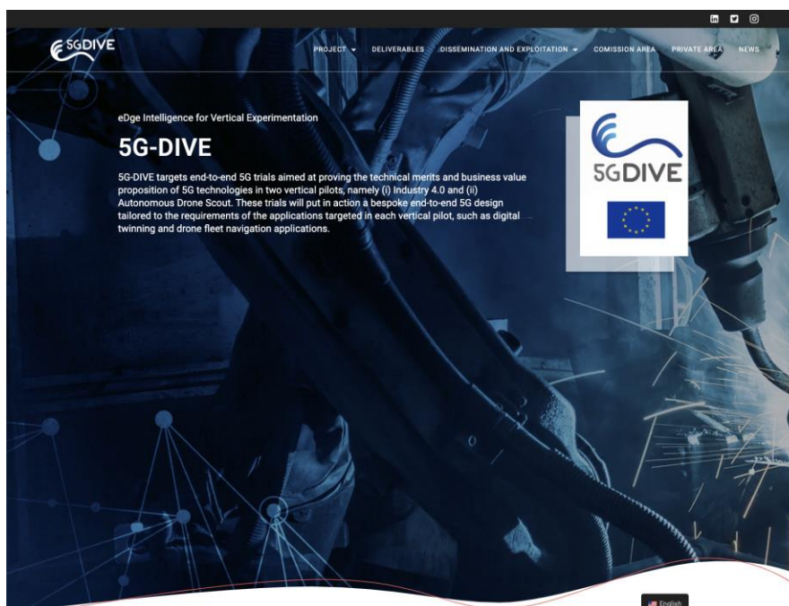
FIGURE 1: 5G-DIVE MAIN WEBSITE.

The project website has been established at the beginning of the project and it is reachable at the following URL: https://5g-dive.eu/ . The landing page is reported in Figure 1. In addition, 5G-DIVE is trying to provide Chinese translation to key content in order to improve the visibility and impact of the project, an example of the landing page for the 5G-DIVE site can be found in Figure 2.